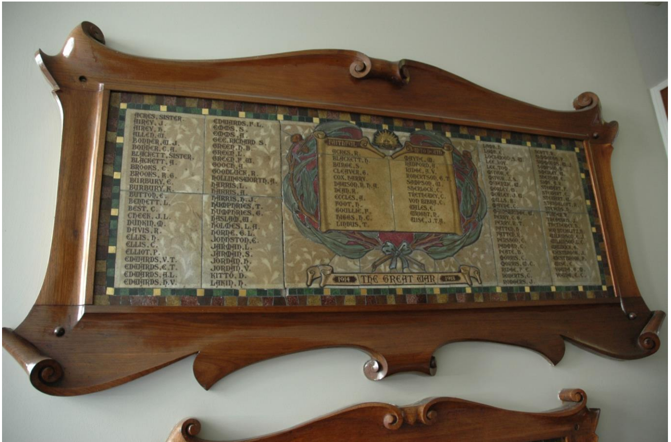
Launceston Paterson Street Methodist Church Honour Roll