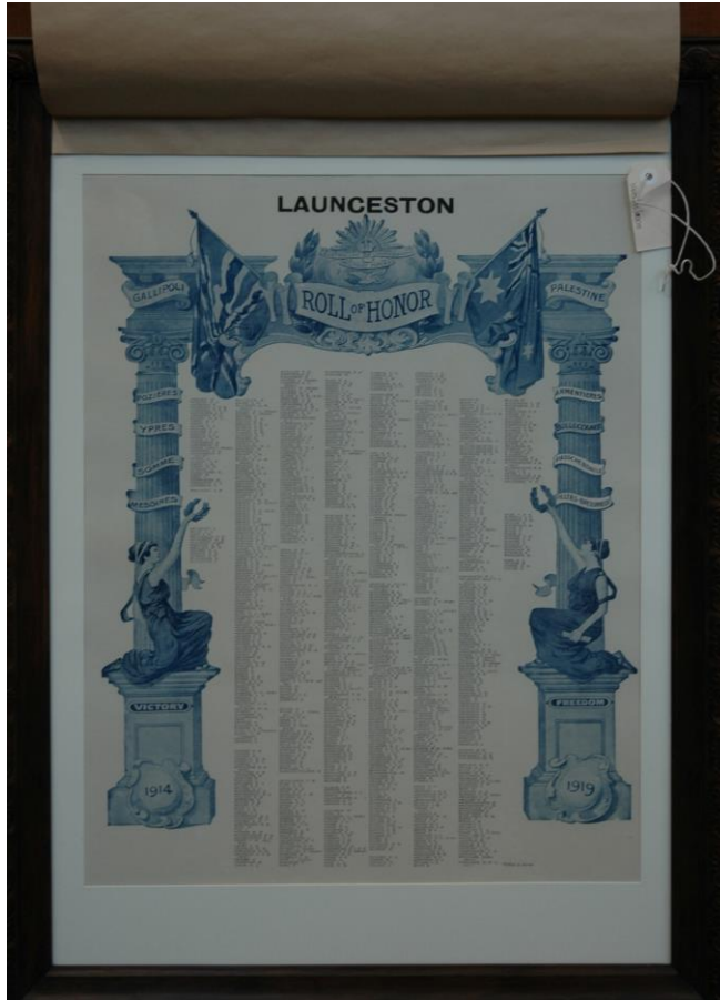
Launceston Roll of Honour